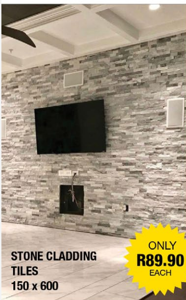
STONE CLADDING TILES 150 x 600

📍 389 Kempston Road, Korsten, PE ☎ 041 373 0180 📞 071 881 3746 ✉ tilemartpe@gmail.com 📱 @tilemartpe 🌐 www.tilemartpe.co.za